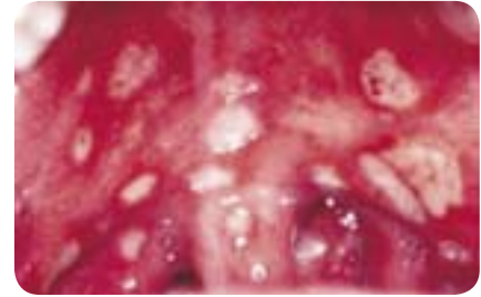
Figure 5: Herpangina, presenting with multiple ulcers on the soft palate, uvula and fauces.

Herpangina affects children, mainly during summer, and is characterised by a sudden onset of malaise, fever and a sore throat. Patients present with vesicles, ulcerations, and diffuse erythema on the soft palate, fauces and tonsillar areas (see Figure 5). The systemic symptoms settle in two to three days and the ulcers heal in seven to ten days.