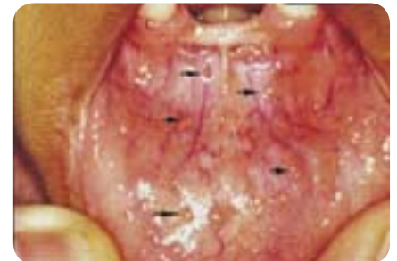
Figure 9: Koplik's spots on the labial mucosa present as numerous small macules (arrows).

tous maculopapular skin rash. The incidence of measles has decreased dramatically in many communities due to successful vaccination programs although it has re-emerged in unvaccinated children, mostly amongst children of poor rural communities. Following an incubation period of 10 to 12 days, a prodromal phase consisting of fever, malaise, conjunctivitis, cough and coryza is seen. This is followed by a generalized exanthematous skin rash. The oral manifestation of measles is known as Koplik's spots. These occur early in the course of the infection and often precede the skin rash by 1 to 2 days. Koplik's spots are white-red macules on that appear on the buccal and labial mucosa (see Figure 9). These macules represent foci of epithelial necrosis. 8