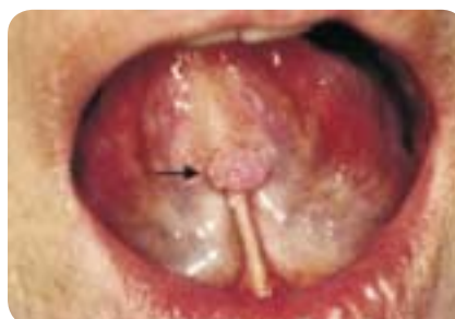
Figure 8: Squamous papilloma presenting as a single cauliflower-like lesion (arrow) on the lingual frenum in an adult.