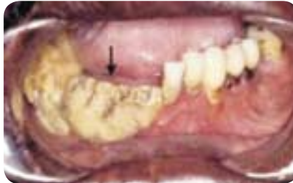
Figure 4: Unilateral necrosis of the mandible (arrow) in an HIV-positive man with a CD4 count of less than 200.

Spontaneous bone necrosis of the mandible, occurring during an acute attack of herpes zoster, has been seen in immunocompromised patients. 5 The patients present with the unilateral vesicles of herpes zoster, with subsequent unilateral exfoliation of the teeth in the necrotic mandible (see Figure 4).