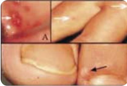
Figure 6: Patient with hand, foot and mouth disease, presenting with (A) intra-oral ulcerations (arrow) secondary to vesicles, with (B) small vesicles on his palm and fingers (arrows) and (C) a vesicle on the toe (arrow) is clearly visible.

mucosa a cobblestone or fissured surface. Most lesions are found in children, although they occasionally can be found in older age groups. They usually regress spontaneously with age.