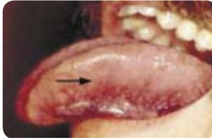
Figure 10: Oral hairy leukoplakia on the lateral border of the tongue, with extension onto the smooth ventral aspect of the tongue (arrow).

Kaposi's sarcoma is characterised by erythematous or violaceous plaque-like lesions that develop into tumorous growths over time (see Figure 11). These larger lesions may become ulcerated and painful and may interfere with function. Kaposi's sarcoma is predominantly seen in the palate or on the attached gingivae, but can appear on other mucosal sites. It has been demonstrated that Kaposi's sarcoma is caused by infection with human herpes virus 8. The clinical diagnosis should be confirmed by biopsy, as several other lesions may have similar clinical presentations. This is especially true for early lesions that may have similar clinical features as vascular malformations, bacillary angiomatosis and even well differentiated angiosarcoma. A variety of treatment options are available varying from intralesional injection of chemotherapeutic or sclerosing agents to surgery or radiation. Regression of Kaposi's sarcoma has been reported in patients receiving combination antiretroviral therapy.