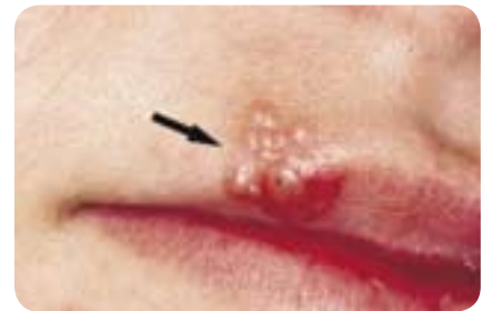
Figure 2: Herpes labialis, consisting of a cluster of vesicles on the vermillion (arrow).

Around 15 to 30% of the community is affected by episodes of secondary herpes simplex lesions (herpes labialis). Common colds, influenza, fever, UV exposure, menstruation, emotional upset, stress and anxiety predispose the patient to recurrent infection, as these cause reactivation of the virus, which subsequently migrates along one of the sensory divisions of the trigeminal nerve. The lesions are most often seen at the mucocutaneous junction of the lip or peri-oral skin (see Figure 2). A burning sensation usually precedes the development of a small cluster of vesicles. These vesicles enlarge, coalesce, ulcerate and become crusted before healing within 10 days.