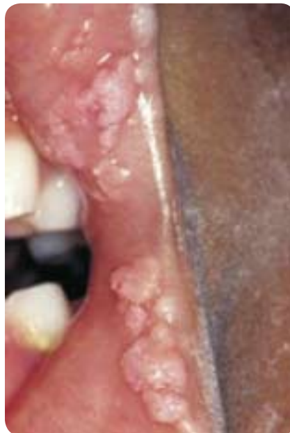
Figure 7: Focal epithelial hyperplasia at the mucosa of the corner of the mouth, consisting of multiple, slightly elevated, mucosa-coloured nodules.

Condyloma accuminatum should not be confused with focal epithelial hyperplasia. It may be difficult to distinguish from squamous cell papilloma, which is usually single and not larger than 0.5 cm. Excision is the treatment of choice. The presence of these lesions in children should raise the possibility of sexual abuse, although on rare occasions they may be transmitted by non-sexual contact. 7