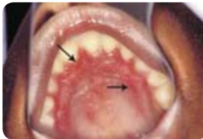
Figure 1: Primary herpetic gingivostomatitis resulting in painful erythematous palatal gingivae (arrows).

pharynx can resemble infectious mononucleosis or a streptococcal sore throat infection. Primary infection in an immunocompromised adult can be life threatening, with disseminated disease, or it may present with extensive non-healing oral ulceration. 2