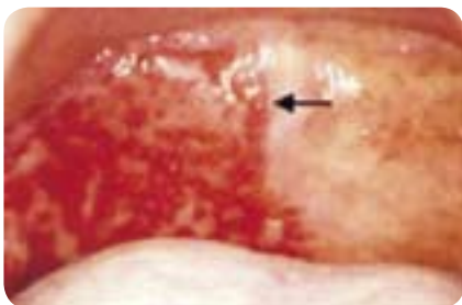
Figure 3: Herpes zoster, presenting with multiple ulcers on the palate. Note the abrupt ending of the ulcers at the midline (arrow).

A number of predisposing factors can lead to a recurrence of the infection in the tissue supplied by the sensory nerve. Conditions leading to herpes zoster are usually those that cause immunosuppression, such as cytotoxic drugs, radiation, internal malignancies, malnutrition, old age, and alcohol and substance abuse. Occasionally, dental manipulation in a localised area can lead to reoccurrence. The first signs of herpes zoster are pain and tenderness in the dermatome corresponding to the affected sensory ganglion. In the head and neck area, vesicles form on one side of the face or in the oral mucosa in one of the divisions of N. trigeminus. These unilateral vesicles form clusters with areas of surrounding erythema, ending abruptly in the midline (see Figure 3). The vesicles ulcerate and form pustules within three to four days. A crust lesion then forms, and healing takes place within seven to ten days. These lesions often heal with scarring and areas of hypo/hyperpigmentation may be seen. When the N. facialis and N. auditorius are involved (via the geniculate ganglion), facial paralysis, vesicles on the external ear, tinnitus, deafness and vertigo may follow. This is known as Ramsay-Hunt syndrome. 4