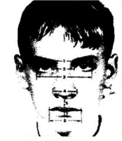
Figure 1: Common facial measurements

Interpupillary distance, (2) inner canthal distance, (3) outer canthal distance, (4) interalar distance, (5) philtral length, (6) upper lip thickness, (7) lower lip thickness, and (8) intercommisural distance