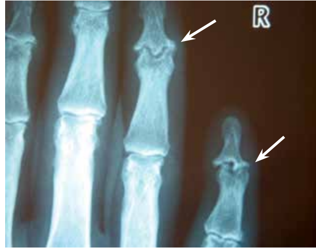
Figure 5: Erosive OA of the hand with classical “gull-wing” appearance (arrows) of the DIP joints

and pain is most commonly located in the groin, but less often referred to the lateral hip, buttocks or knee. Reduced extension and limited motion on internal rotation are characteristic early features of hip OA. The superior aspect is most commonly involved on radiographic images. Other causes of “hip pain” may include trochanteric bursitis, thoracolumbar or sacroiliac disease and intrapelvic pathology.