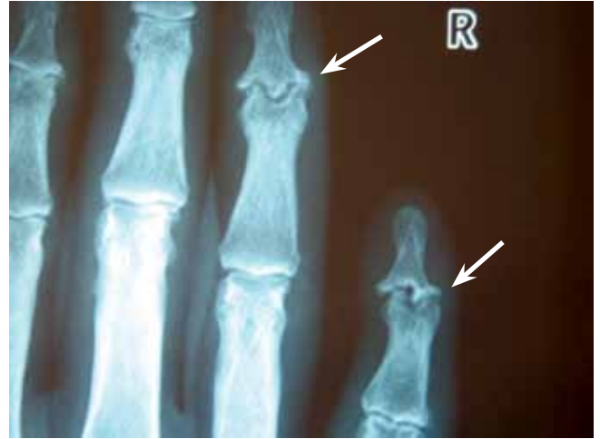
Figure 5: Erosive OA of the hand with classical “gull-wing” appearance (arrows) of the DIP joints

and pain is most commonly located in the groin, but less often referred to the lateral hip, buttocks or knee. Reduced extension and limited motion on internal rotation are characteristic early features of hip OA. The superior aspect is most commonly involved on radiographic images. Other causes of “hip pain” may include trochanteric bursitis, thoracolumbar or sacroiliac disease and intrapelvic pathology.