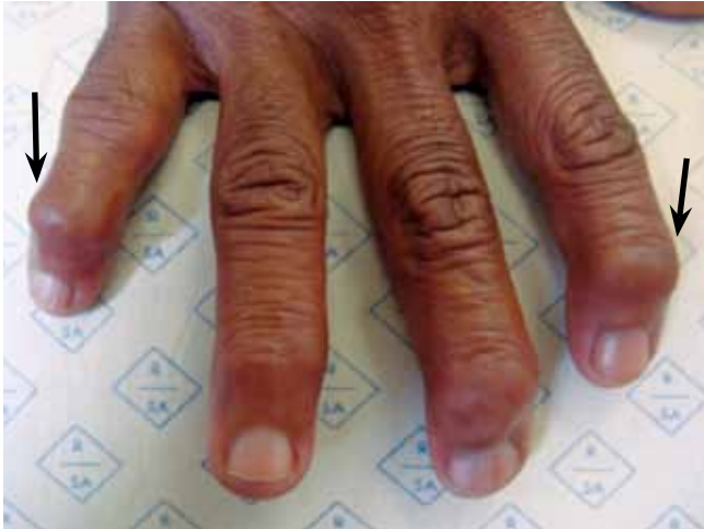
Figure 4: Nodal OA of the hand with Heberden's nodes at the DIP joints (arrows)

hard (osteophytes). The tendency to develop nodes may be familial. An erosive variant, which almost exclusively affects postmenopausal females, is characterised by frequent recurrent inflammatory flares over many years. Multiple DIP or PIP joints may be involved often resulting in deformity and ankylosis of the joint. Inflammatory markers (CRP and ESR) may be slightly elevated. Radiographs are characteristic showing central erosions with a hallmark “gull-wing” appearance (Figure 5). It is important to rule out superimposed gout in patients with erosive OA. Periarticular “punched out” erosions may be present with underlying tophaceous gout.