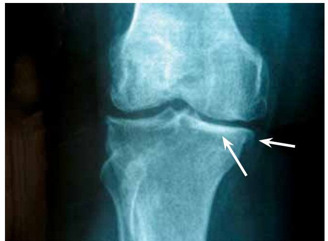
Figure 3: Radiograph of the knee shows medial joint space narrowing, subchondral sclerosis and osteophyte formation (arrows)

It is important to note that pain and severity of radiographic changes do not always correlate. However, patients with a longer history and persistent severe symptoms of OA are more likely to demonstrate structural X-ray changes. The characteristic X-ray features of OA include focal joint space narrowing, subchondral sclerosis, subchondral cysts and osteophytes (Figure 3). Calcification of cartilage may point to secondary OA and pseudogout. Weight-bearing standing radiographs of knees should be requested to correctly evaluate for joint space narrowing. Ultrasound and magnetic resonance imaging modalities are not discussed here.