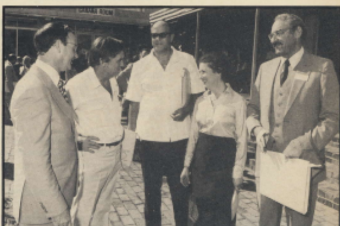
Delegates relaxing during a tea break at the second General Practice Congress in Cape Town.