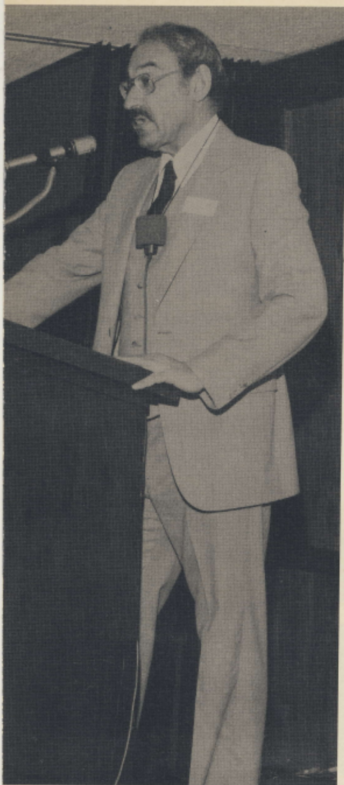
GP Congress in Cape Town and also addressed the 250 delegates on