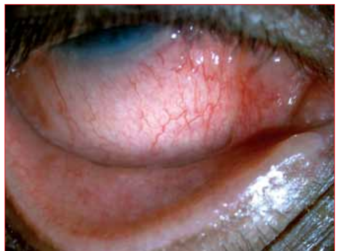
Figure 1: Erythema and chemosis of the conjunctiva in a patient suffering from acute contact dermatitis of the eyelids

A delayed allergic reaction is characterised by the following: