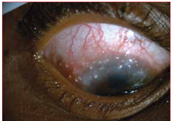
Figure 5: Vernal keratoconjunctivitis (limbal form showing Trantas dots)

in less pigmented individuals living in cooler climates. In the limbal form, a thickened, gelatinous ring may form around the cornea, which often contains whitish dots called Trantas dots (Figure 5). This form frequently occurs in more pigmented patients who live in hotter climates.