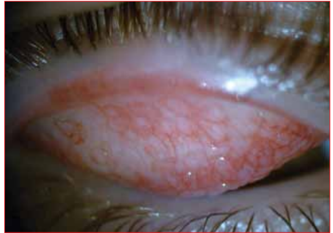
Figure 4: Vernal keratoconjunctivitis (palpebral form)

Signs tend to occur either under the upper eyelid (palpebral form) or around the cornea (limbal form). In the palpebral form, giant papillae may form on the conjunctiva under the upper eyelid (Figure 4). This form is commonly seen