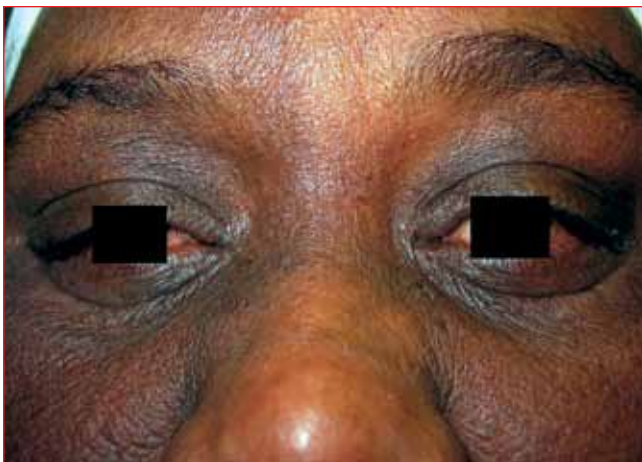
Figure 2: Thickened, wrinkled skin around the eyes of an adult with atopic dermatitis