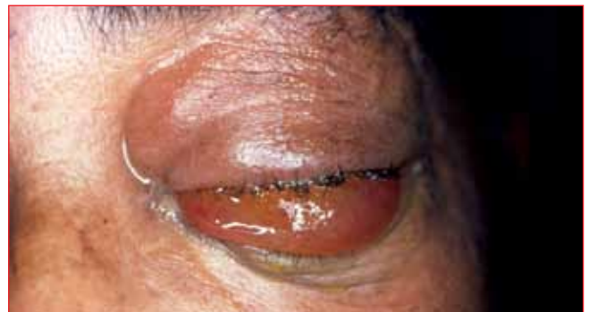
Figure 3: Swollen eyelids and conjunctiva in acute allergic conjunctivitis