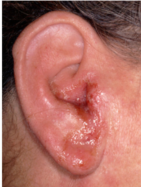
Figure 2. An auricle and ear canal affected by acute otitis externa and exhibiting a type IV hypersensitivity reaction to neomycin. Note the drainage pattern of the ear drops that have incited a cutaneous reaction on the ear lobe.