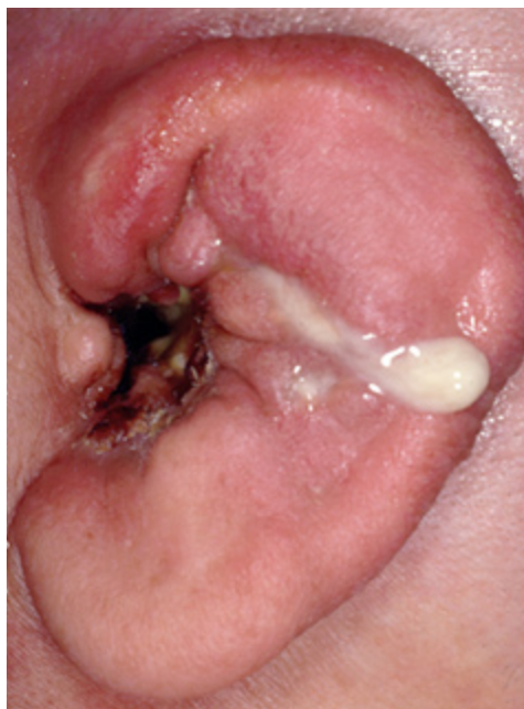
Figure 4. Malignant external otitis with pus draining from the necrotic ear canal and underlying osteomyelitic bone. The adjacent auricle demonstrates the swelling and loss of cartilaginous architecture characteristic of chondritis.

Ototopical not effective against bacteria or fungi involved (or it is a mixed bacterial and fungal problem)