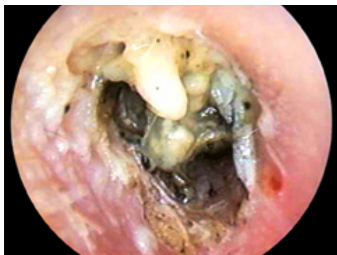
Figure 1. Acute otitis externa with the canal somewhat narrowed from edema and obstructed by desquamating epithelium, soft cerumen, and purulent discharge; this must be removed to visualize the tympanic membrane and to allow ototopical therapy to penetrate to all the superficially infected areas of the canal skin.

pain exacerbated by tragal pressure or movement of the auricle ( Figure 1 ). In the severe stage, pain is intense, the lumen of the canal obstructed, and extra-canal signs such as auricular cellulitis, parotitis, or adenopathy are likely. 2,4-6,9